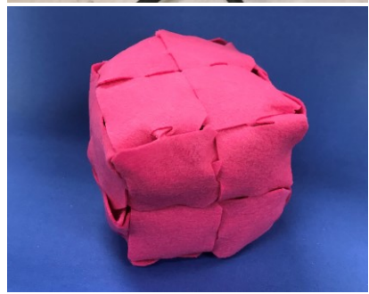
Figure 6 - The swatch templates are flexible to various applications included wearable e-textiles, interiors and decoration, and soft objects such as soft toys