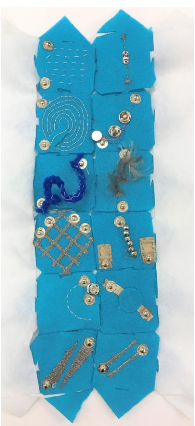
Figure 4 - Swatch-bits laid out and woven together