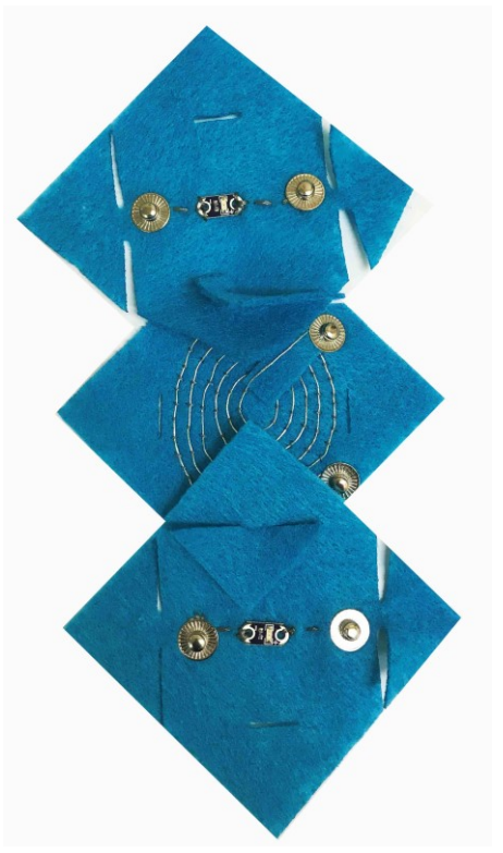
Figure 1 - Modular e-textile swatches